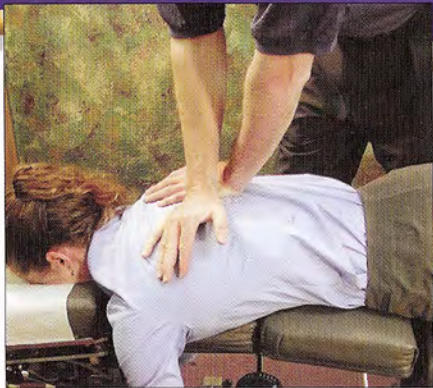
When spinal function improves, your symptoms usually improve too.

It surprises many patients when they discover chiropractic doctors don't treat symptoms. A traditional medical approach works on symptoms by using drugs or surgery to numb, slow down, speed up, or cut out the malfunctioning body part. Instead, chiropractic doctors find the underlying cause(s) of your ache or pain, and correct it. This improves symptoms naturally.